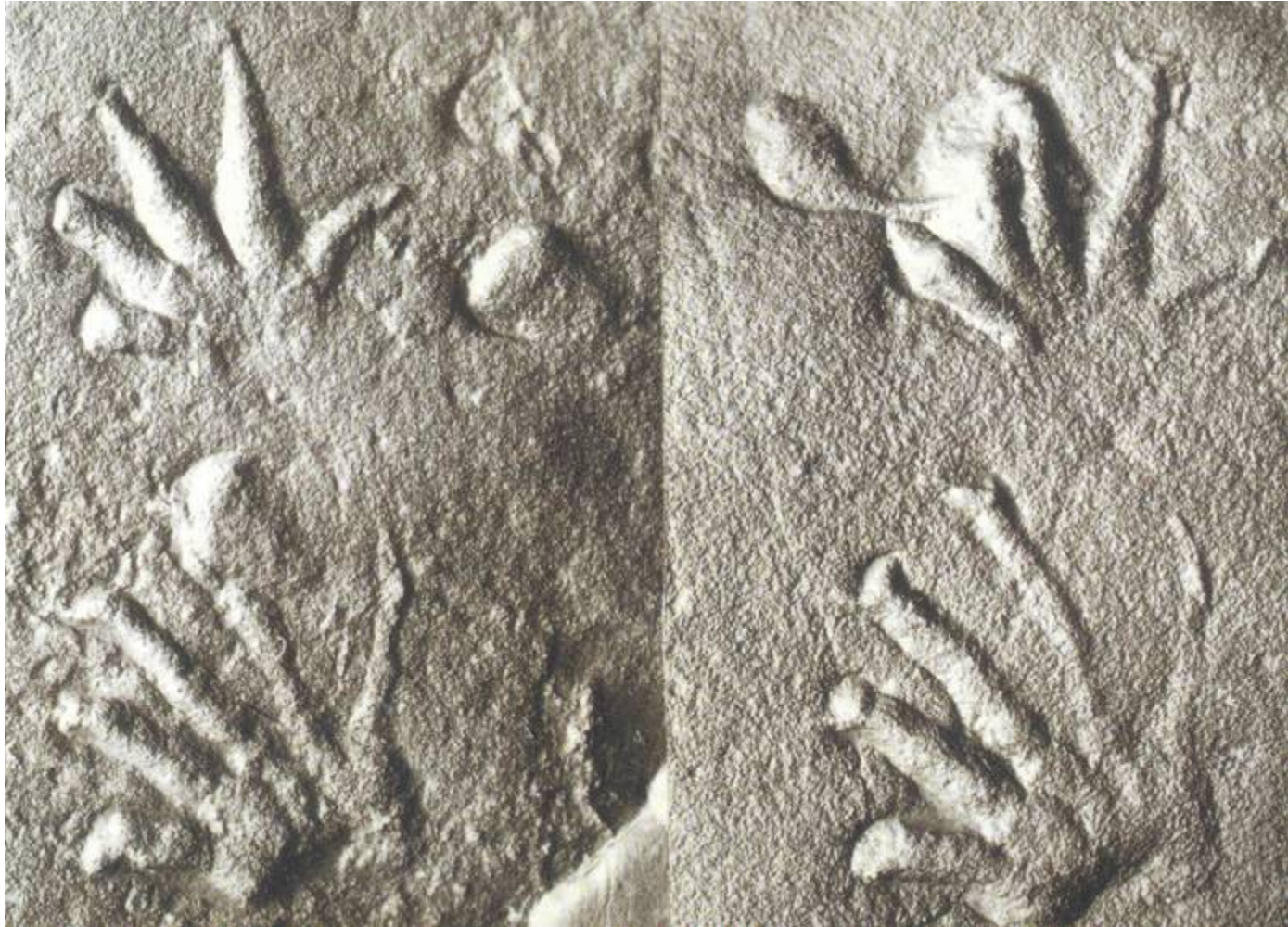
280 million year old footprints from Germany